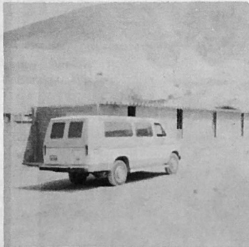
Building 14x52 feet for Sunday School Classes. The Inside Wall is to be the outside Wall of our Church. The Van, a 1987 Ford - 16 Passenger - We call it the Work Horse. Bro. Bean's Work in Ventanilla, Peru.