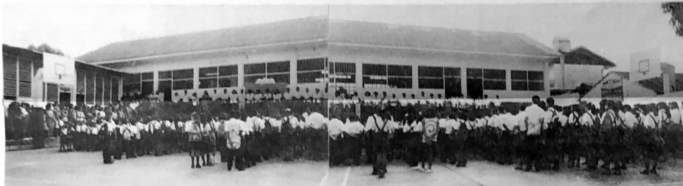
First Day of School — Pucallpa Baptist School, Pucallpa, Peru