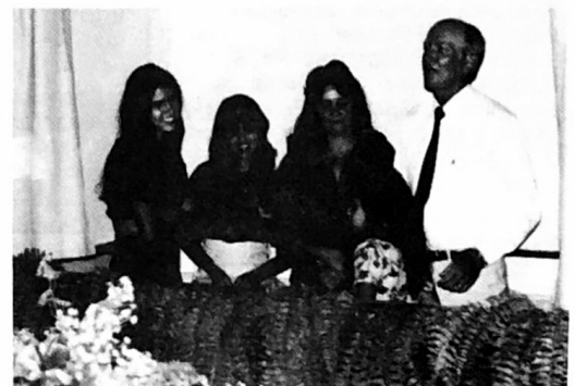
Right: Baptism - First Baptist Church, Cruzeiro do Sul, Acre, Brazil. Mike Creiglow's Work.