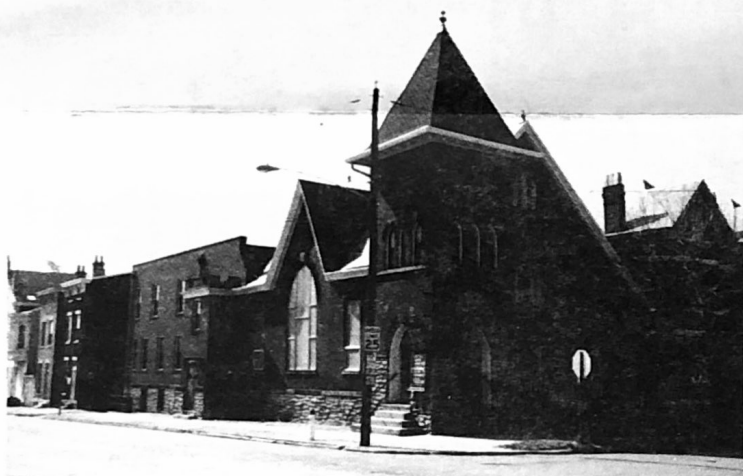
Church building of Bible View Baptist Church, Newport, Ky.