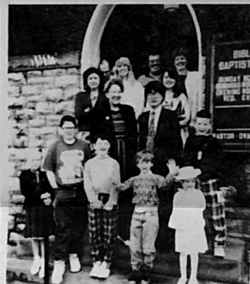
Sunday Morning after service of Bible View Baptist Church, Newport, Ky.