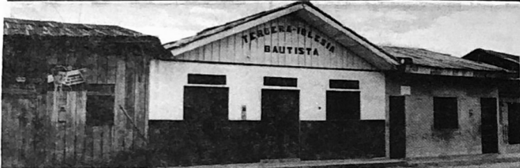
The Third Baptist Church in Iquitos, Peru.