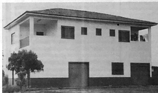
New Mission Building from the Outside in Brazil Harold Drapers Work.