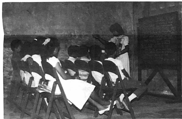
Teaching Sunday School in our Mission Works.