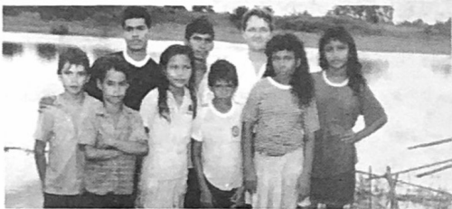
Baptism at Ressaco do Pesqueiro, March 1991.