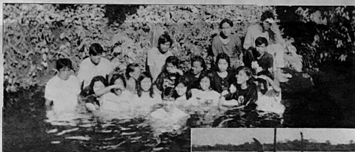
Our Baptismal Service, Nov. 25, 1990 - 17 souls were baptized. Praise the Lord. Please include them in your prayers. Four of them (young ladies and they are sisters) are now being persecuted by their father.