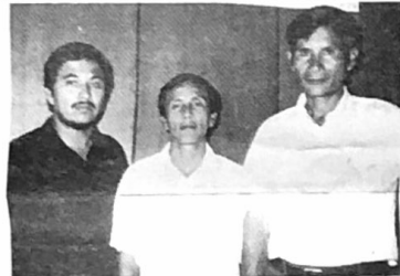
Faithful Pastors in and around the City of Iquitos.