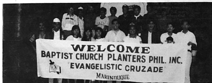
Bible Baptist Church, Preachers and Workers Before Departure For Missionary Trip to One of Philippine Islands.