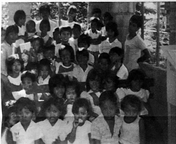
You will see in this picture the hollow block walls without windows. This serves as our Sunday School Room in the Philippines.

Remember The Thanksgiving Offering ★ Our Missionaries Need Our Support