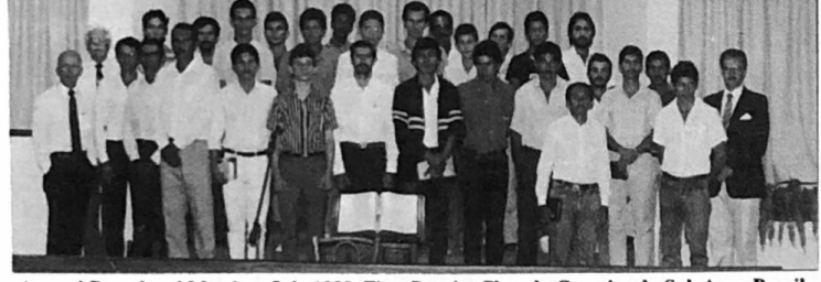
Annual Preachers' Meeting, July 1989. First Baptist Church, Cruzeiro do Sul, Acre, Brazil.

Completed Four Years for This Term . . . Three Professions of Faith . . . Have Physical Checkups . . .