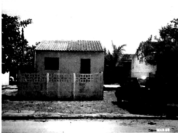
Temporary Meeting Place at Tijucal Work Until New Building is Built. Brother Harold Draper's Work in Central Brazil.