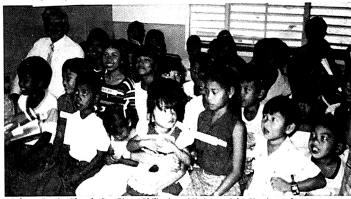
Calvary Baptist Church, Las Pinas, Philippines. Mis songs with the children.

Visitors from the States . . . Sick with Pneumonia. Works Going Well But Need More Space . . .