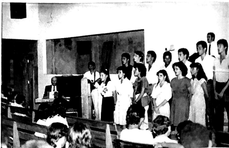
Young People's Choir of First Baptist Church of Cruzeiro do Sul, Brazil, September 1986 Mike Creiglow's work.