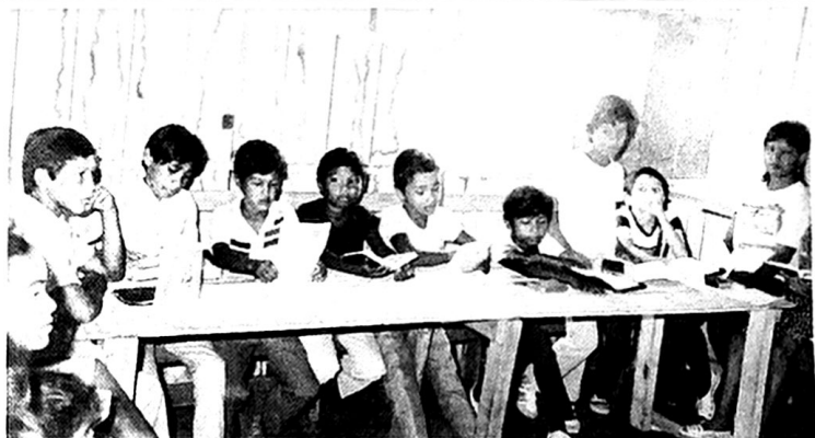
One of the Sunday School classes at Mauazinho, Brazil.