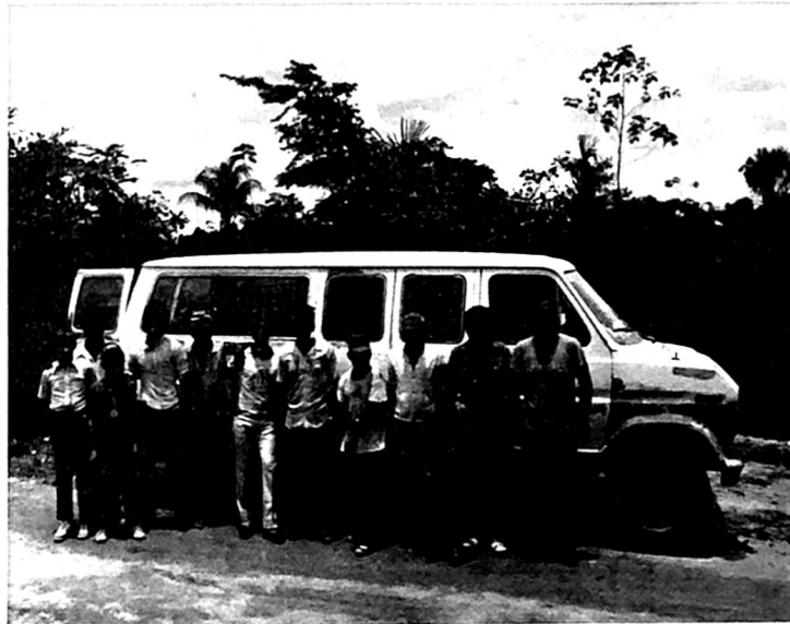
Construction team going to work on building at new church "Divine Grace Baptist Church" Pueblo Santo. Brother Gasque's work.