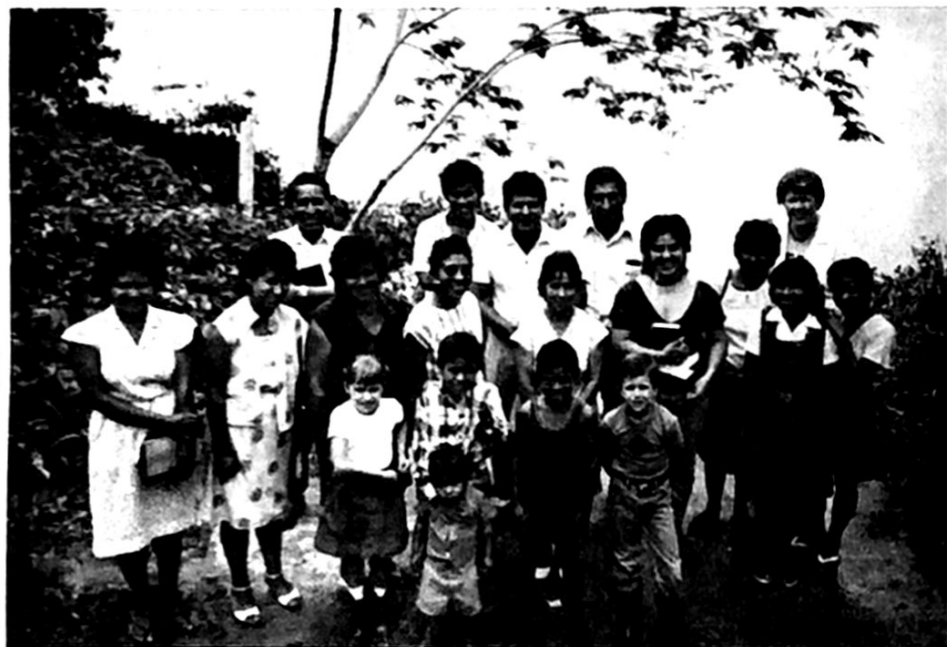
Some of the members of the new mission work we've started in Yarinacocha, Peru, January, 1986 at the first baptism.