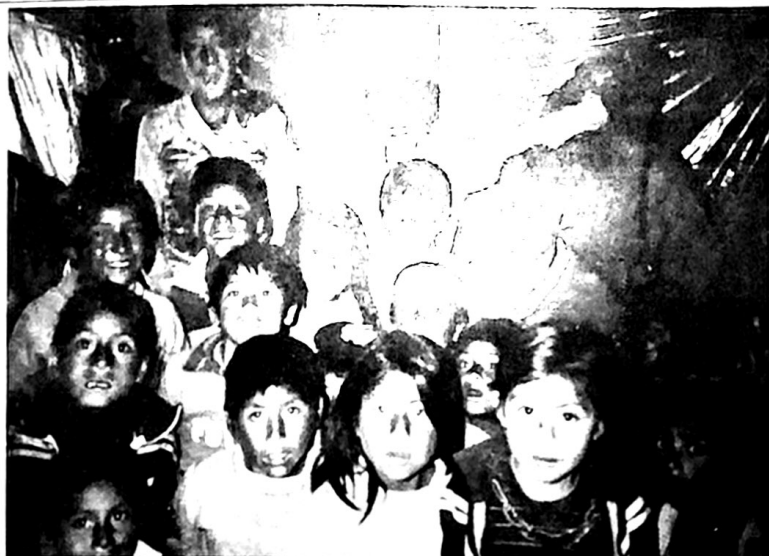
Young people from the work in Chavinillo, Peru. Homer Crain's work.