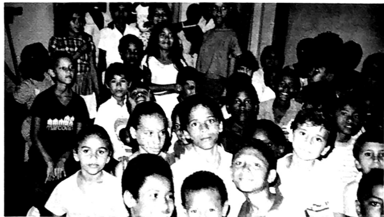
Happy faces of 9 to 14 year olds at Vacation Bible School at New Hope Baptist Church, Sao Luis, Brazil.