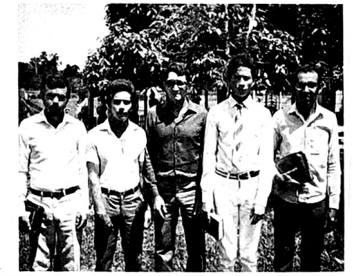
Five of eleven preachers of Maita Baptist Church, Brazil.