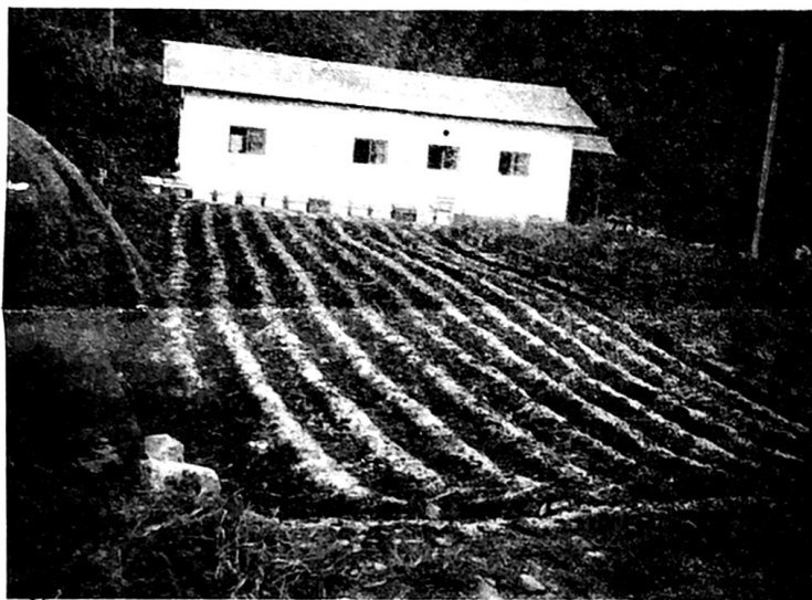
Doo Mill Baptist Church building in Korea. Brother Carver started this work. Peppers and other vegetables are grown next to church and bees are kept.