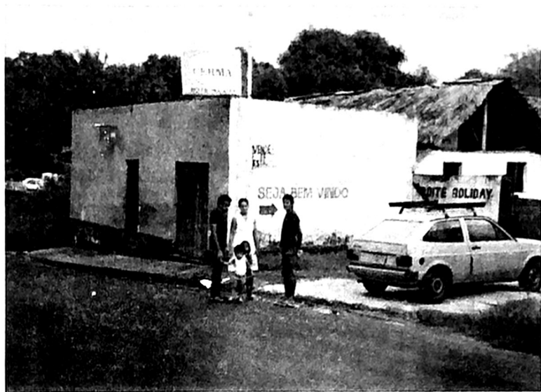
Front view of nite-club bought by New Hope Baptist Church. Sao Luis, Brazil.