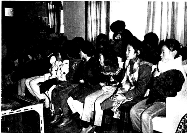
New Year's Eve service for children at Shin Nae Baptist Church, Korea.