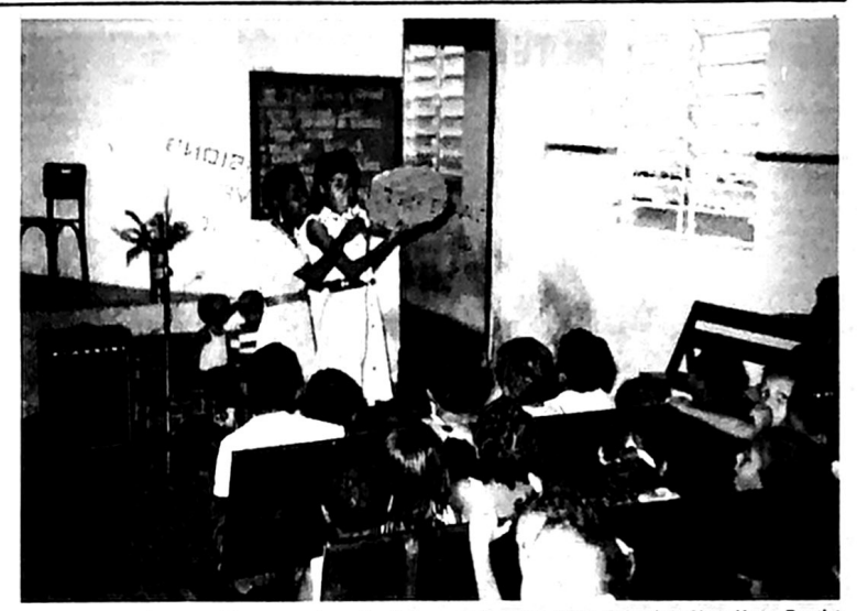
Two young members teaching youngsters about Jesus at Vacation Bible School at New Hope Baptist Church, Sao Luis, Brazil.