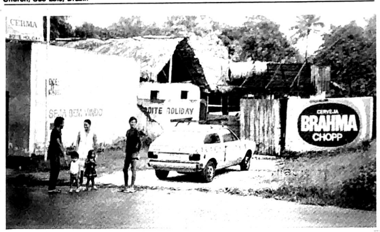
Side entrance view of property bought in Sao Luis, Brazil by New Hope Baptist Church. For