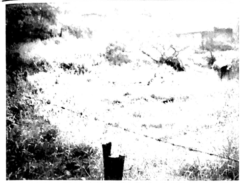
d in Sao Luis by No