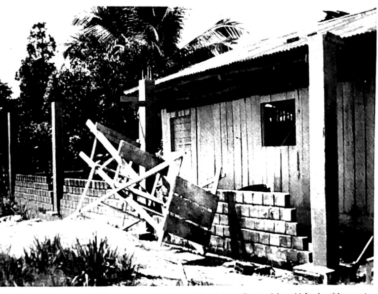
fferings of the people in Santo Tomas

Let Your Support of Baptist Faith Missions Be Continued In Your Will.