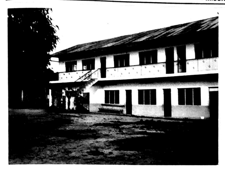
Main school building in Pucallpa, Peru. Brother Sheridan Stanton's work