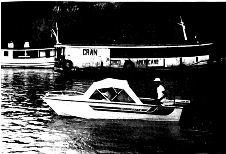
Some of Mike Creiglow's young preachers leaving on a preaching mission up river.