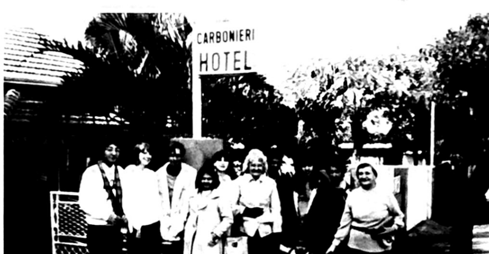
Our group posing with the owner of the small hotel where we stayed during our week in Cornelio Procopio. Owner on right with small child she is caring for.