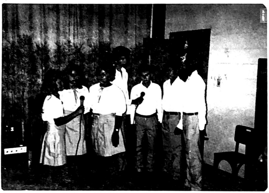
Singing group at Faith Baptist Church, Varzea Grande, Brazil.