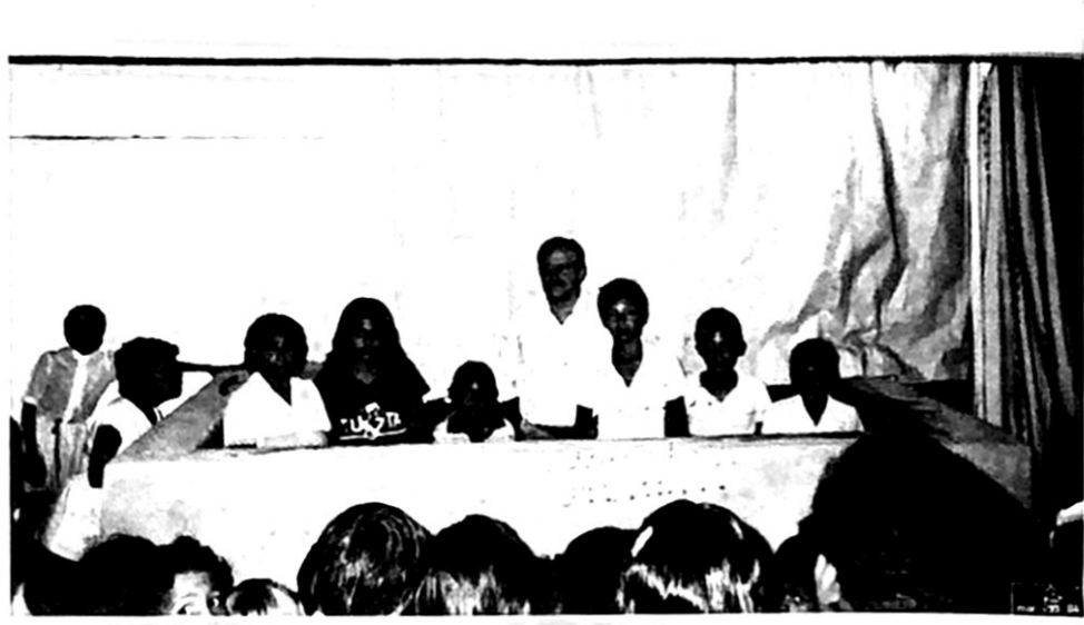
Seven baptized in Garca on the 11th of March. One man not show