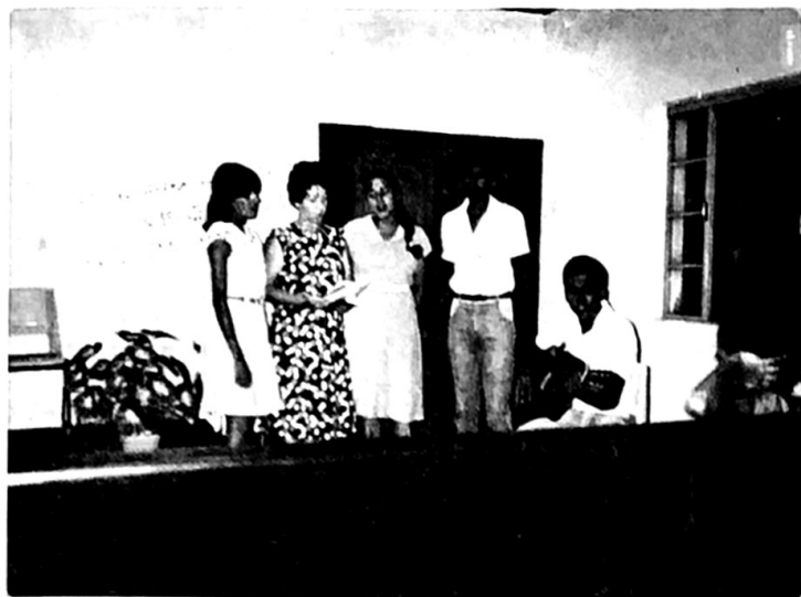
Singing group at Boa Esperanca singing the praises of the Lord! Cuiaba Brazil. Brother Turner's work.