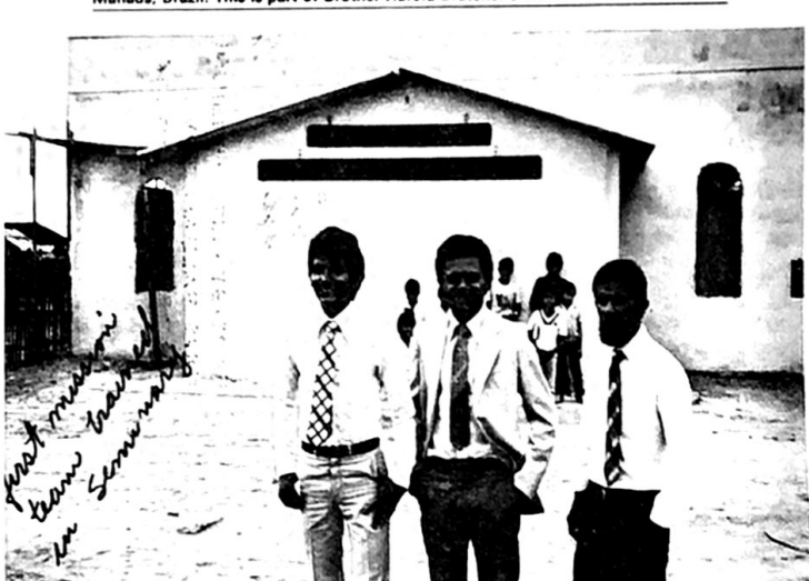
Three young preachers trained by Seminary in Manaus, Brazil. They are all active in the Lord's work.