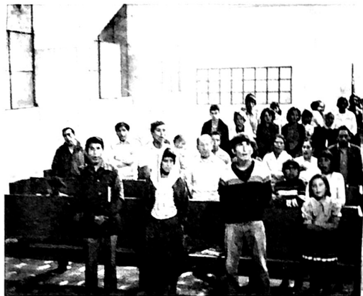
Church building at Huanuco, Peru. Brother Crain's work. The columns on the sides cause an echo which they hope to correct.