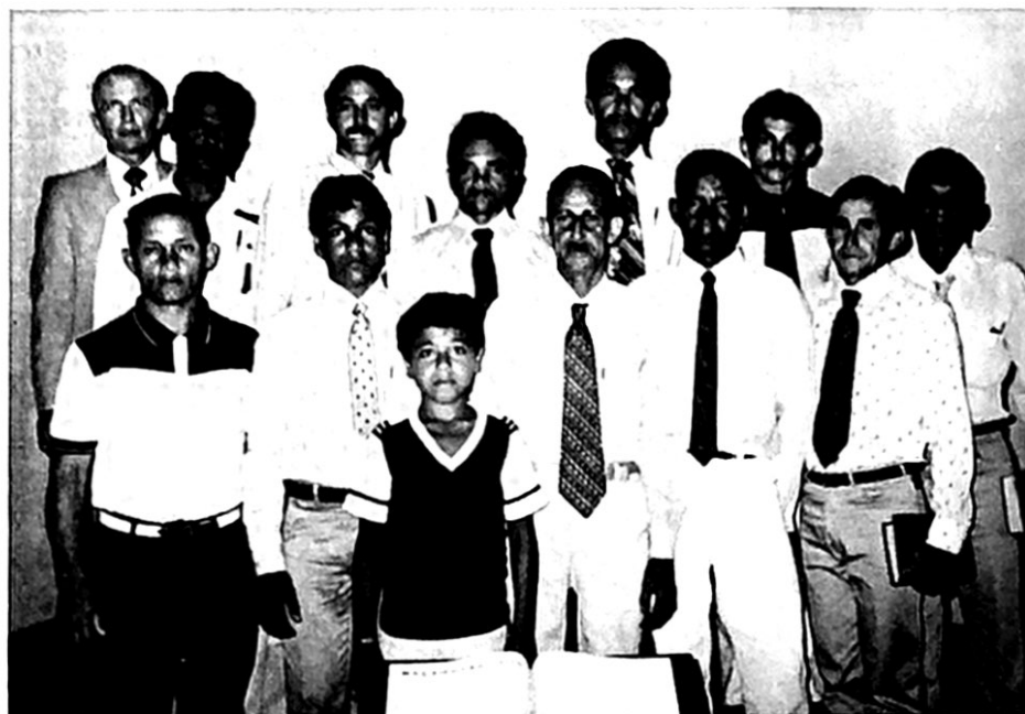
Some of preachers of First Baptist Church, Cruzeiro do Sul, Acre, Brazil.

Continued on page 2, col. 1 (S. BRATCHER)