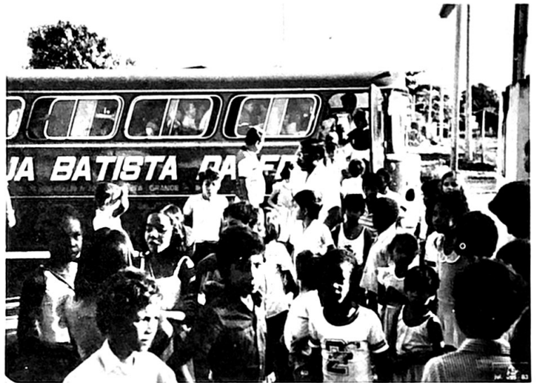
June 19, 1983 - 530 persons in Sunday School, Faith Baptist Church - Varzea Grande.