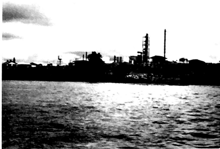
Gasoline refinery on the Amazon. Our missionaries travel this river often to get to their preaching points in Brazil and Peru.