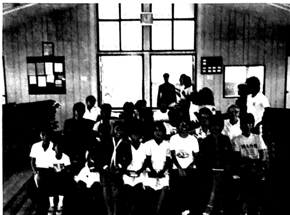
Some of the members present at a baptismal service in the Philippines.