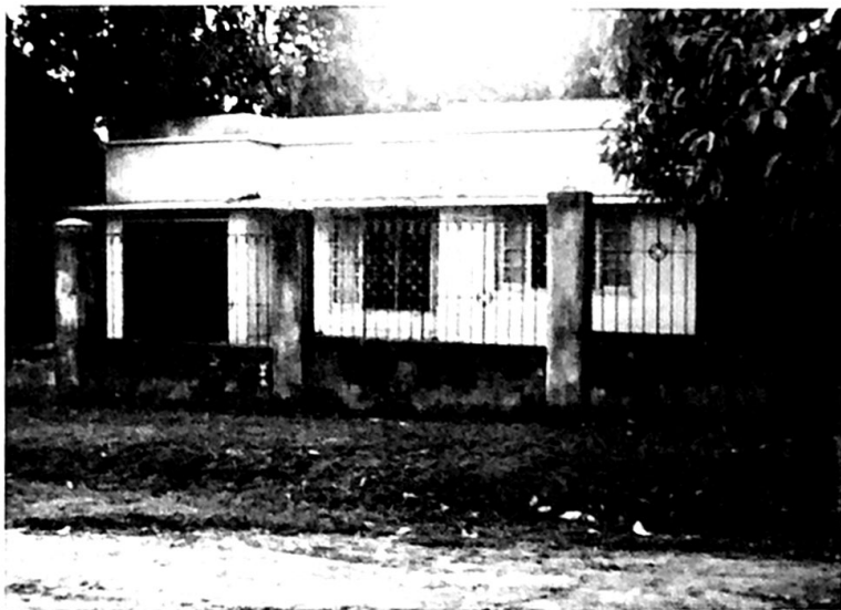
Front of mission house in Pucallpa, Peru. The Stantons hope to be moved in soon. Help them get there by increasing your support.