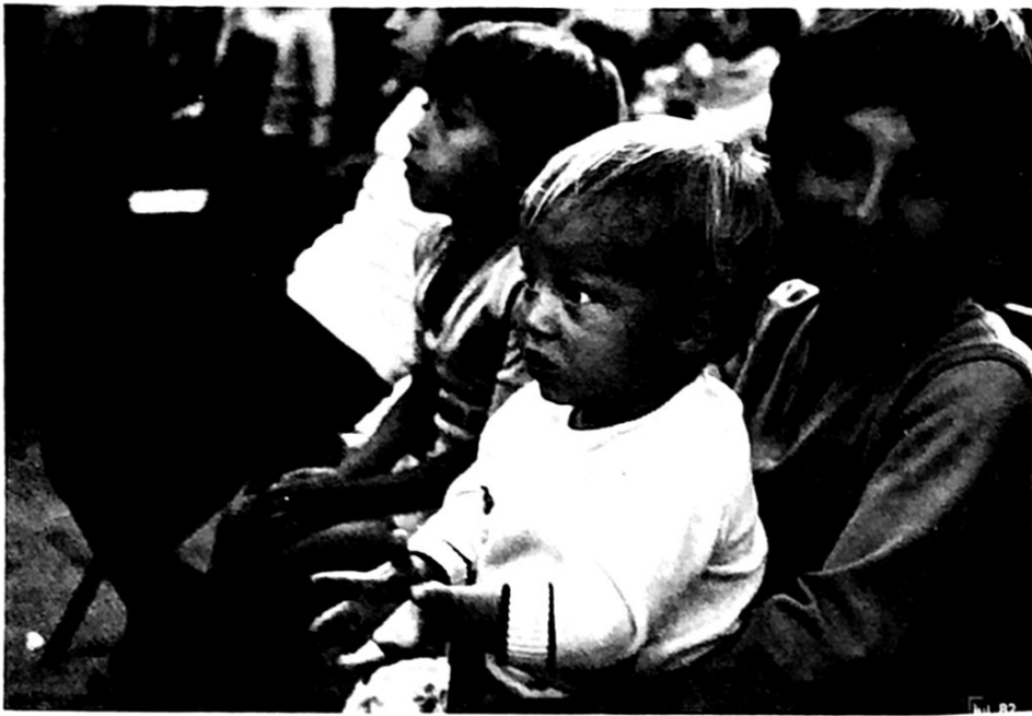
Little ones can come to Jesus in Duartina Mission. Thanks to those who give. Duartina, Brazil.