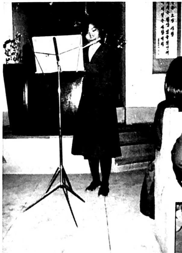
A young Korean girl playing for the Glory of the Lord in Shin Nae Baptist Church, Seoul, Korea. Make a Joyful Noise unto the Lord.