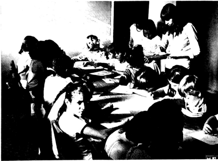
Color time in V.B.S. in the Galia Baptist Church, Galia, Brazil.