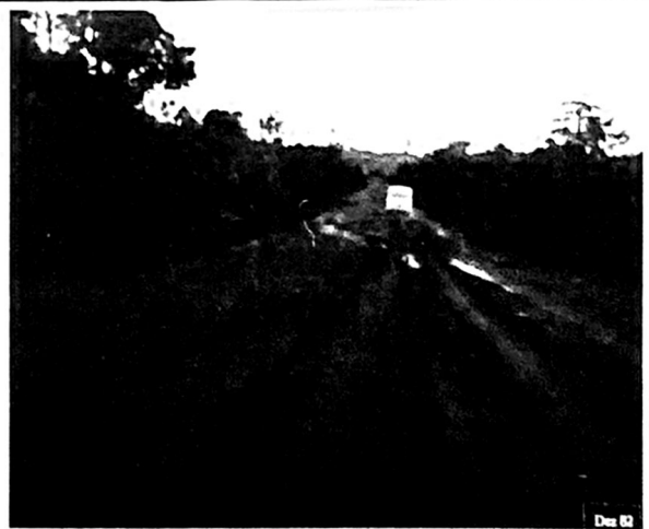
On the road from Manaus to Boa Vista to start a new work for the Lord in Brazil.