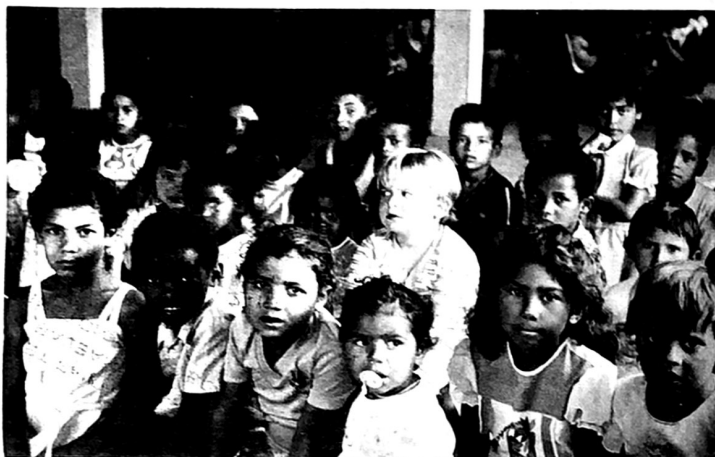
Class of 5 and 6 year olds at Garca Baptist Church Sunday School.