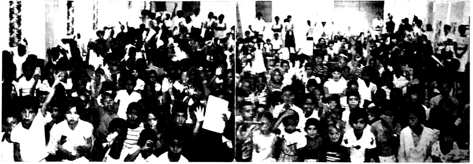
A picture of part of the crowd in Garca, Brazil. 310 were in Sunday School that morning.