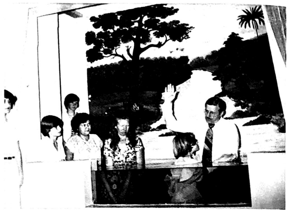
Three persons from Garca and two persons from Galia receive baptism.