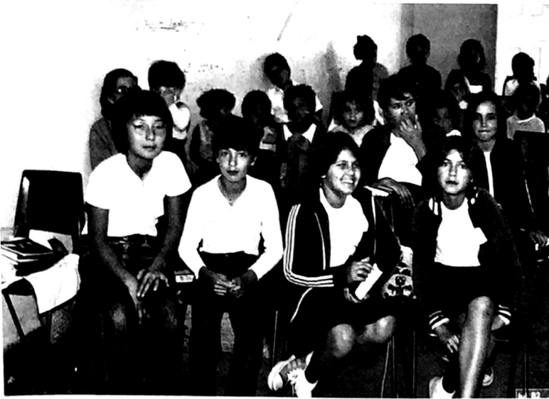
Vacation Bible School in Durantina - The Bible stories are great.