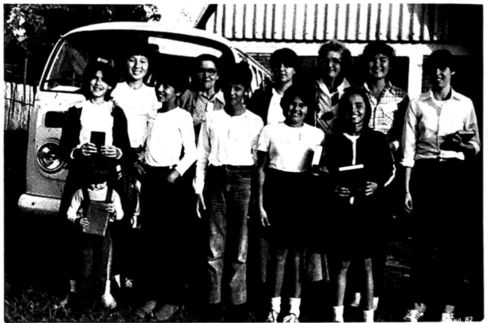
Making disciples to disciple others. All ten of these workers have been saved and baptized in Garca. Two boys on left are called to preach.