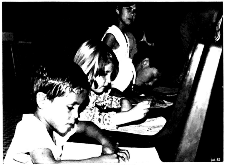
Galla - Chairs have to serve as tables when color time comes at Bible School.