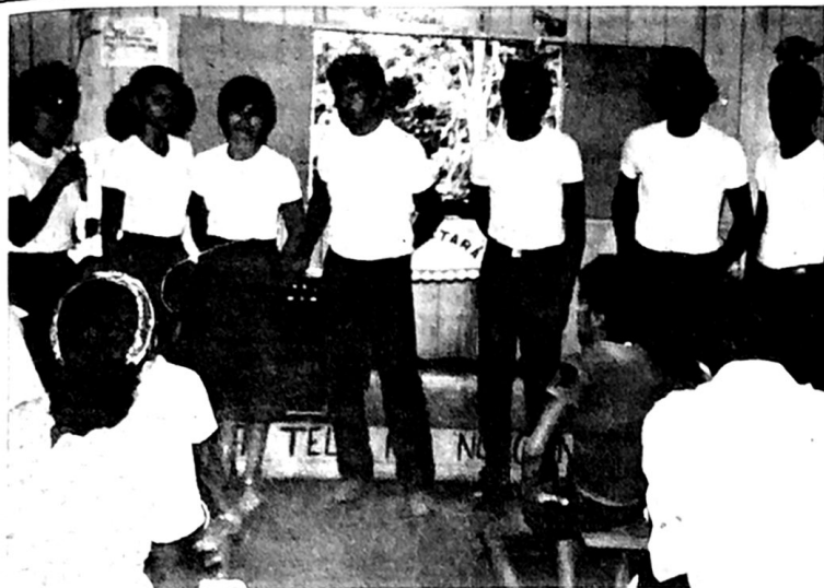
The singing group of the 14th of December Baptist Church "Lily of the Valley" singing at the New Jerusalem Baptist Mission, Parana da Eva, February, 1982.