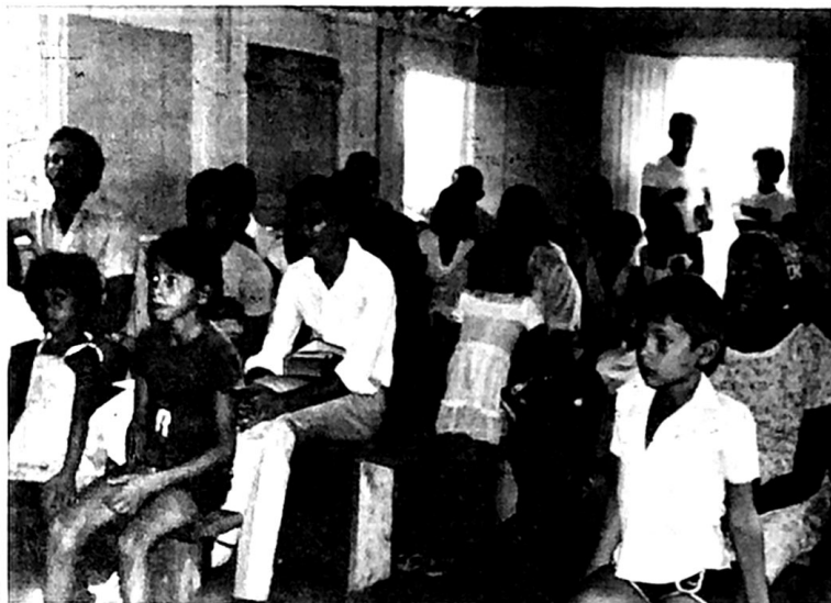
Service at New Jerusalem Baptist Mission, February, 1982.