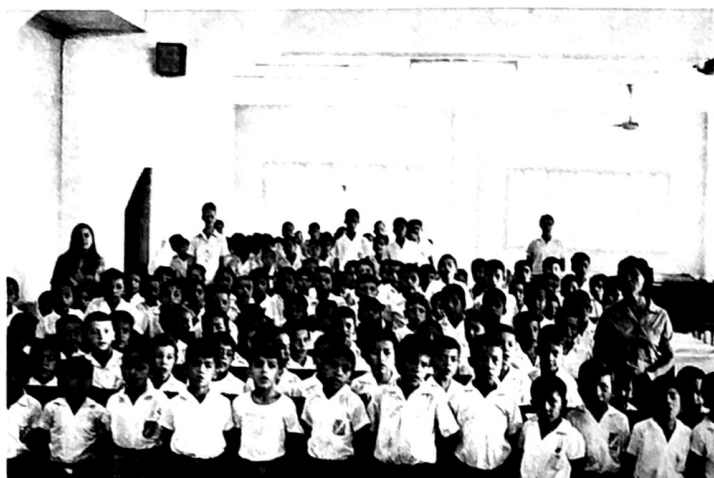
Mayfield School - Pucallpa, Peru. Boys in left picture, girls in right picture.