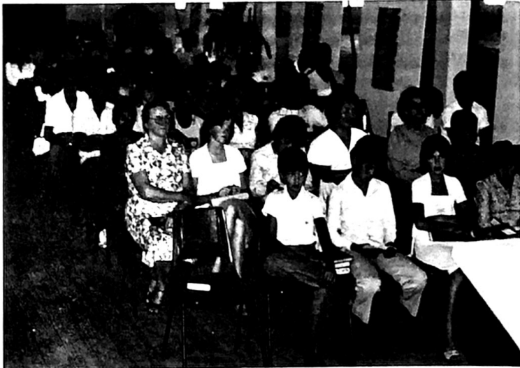
Crowd present at organization of Galia Baptist Church and Central Baptist Church of Garca.

Remember Baptist Faith Missions Along With Your Church In Your Will