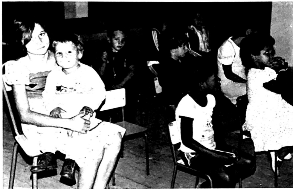
Sunday School class of beginners. Teacher saved and baptized in this new work.