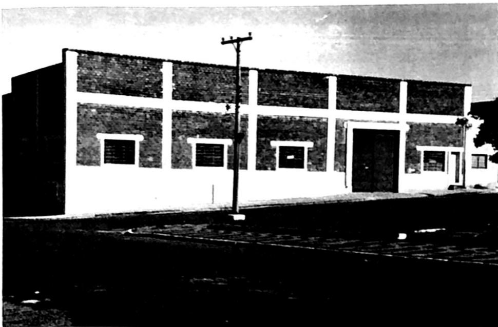
Help us to raise $5,000 for our payment on this building in Garca. Payment is due on August 6th. No interest nor other costs are being paid on unpaid balance.