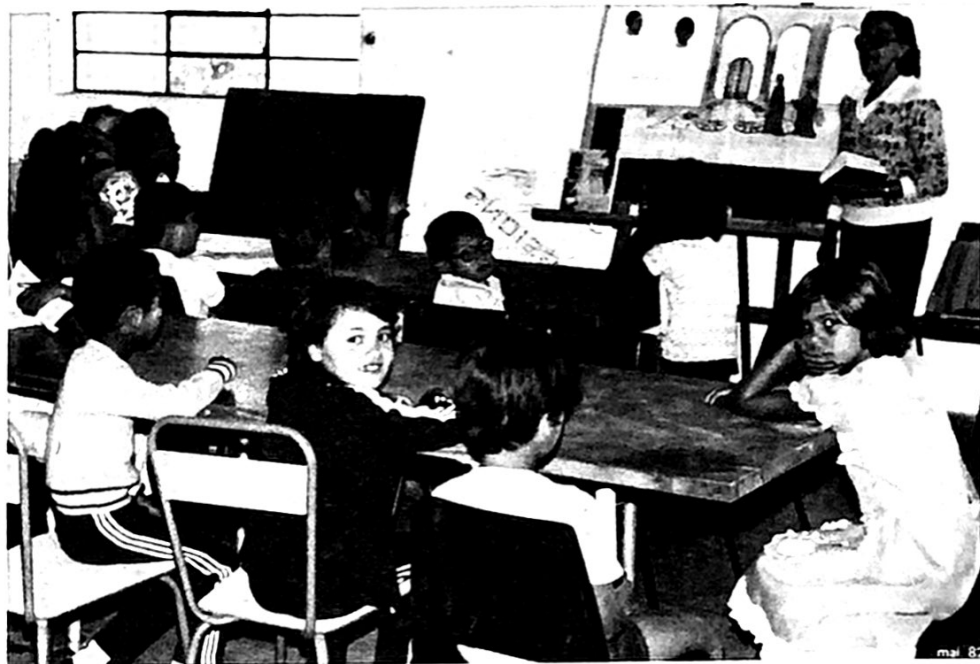
Sunday School class in new building - Garca. Teacher saved and baptized in this new work.