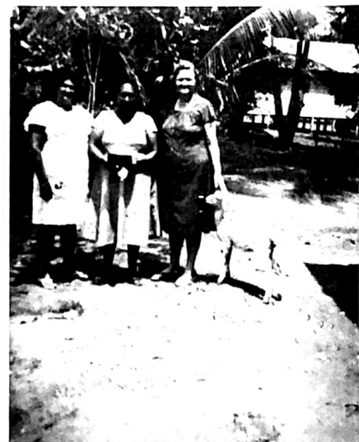
Three sisters in the Lord at New Jerusalem Baptist Mission.