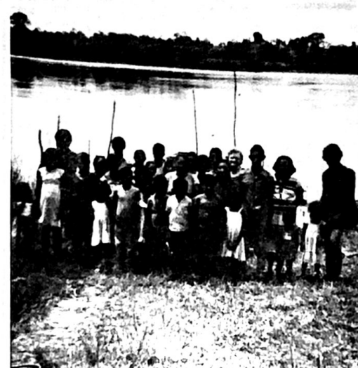
After a baptism at New Jerusalem Baptist Mission, Parana da Eva, Amazonas, Brazil.