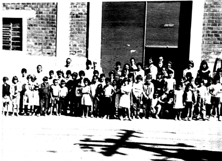
Sunday School attendance on first day in new building in Garca. Attendance has increased every Sunday since with an average for the last month of 110.