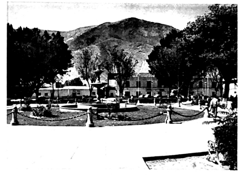
Plaza in Huanuco, Peru where Brother Crain has been called to serve the Lord