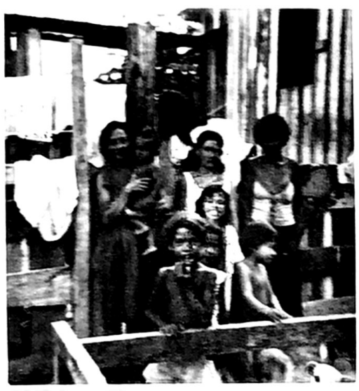
These three ladies are members of the 14th of December Baptist Church. The poor have