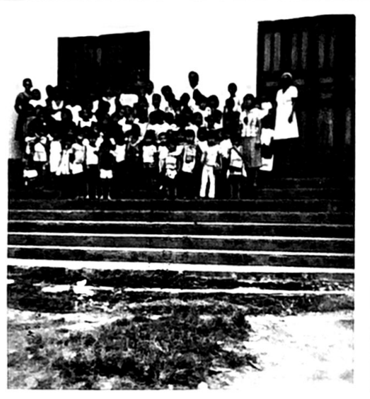
Primary class in front of 14th of December Baptist Church