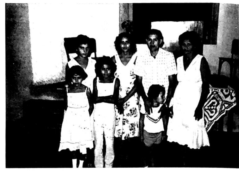
Family of man being baptized in Sao Luis. Only husband is saved in this large family. Pray that all may be saved.