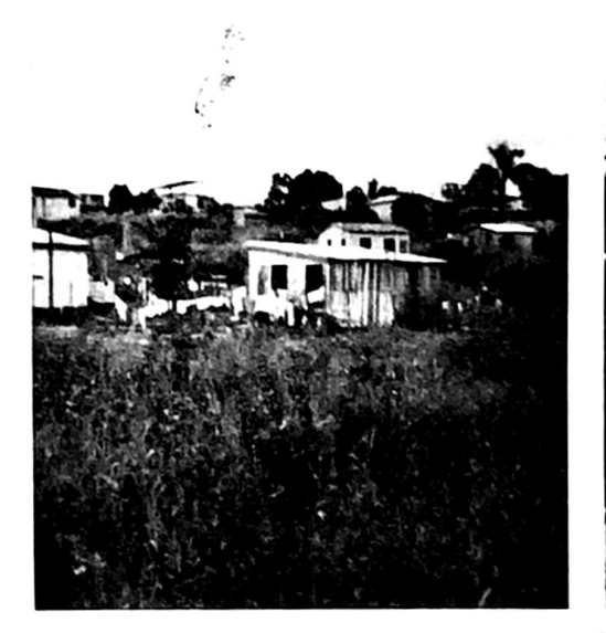
Many of the members of the 14th of Decer ber Baptist Church live in houses like these.