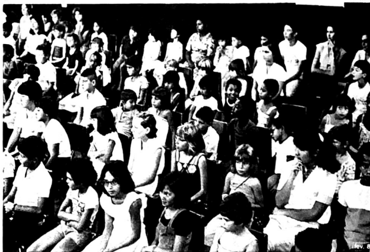
A part of the crowd in the Mission of Garca during Bible school in January 1982. Brazilian Work.