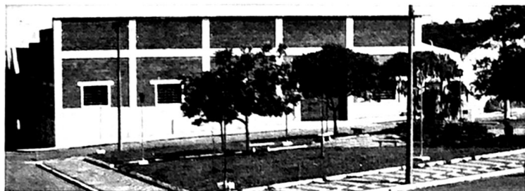
View of newly acquired building in Garca, Brazil. Here you see the small attractive park and the wide streets and easy access to the building. Thanks to you who have given. Rejoice with us.