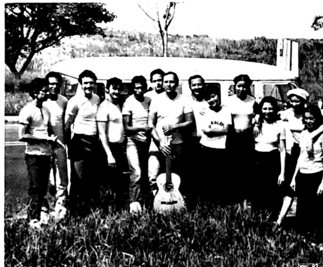
A student work team from Baptist Theological Seminary of Manaus. They go out and work for the Lord in the Baptist churches and missions.