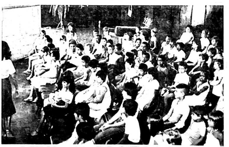
The Seminary team at work In Garca. Every seat filled during the entire