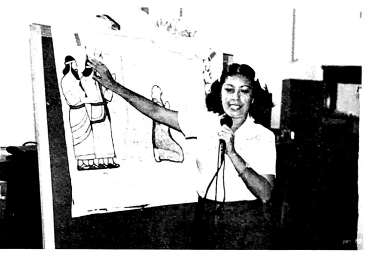
the story of Daniel to a group of attentive children in Bible