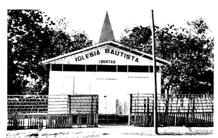
Libertad Baptist Church, Pucallpa, Peru

for us and want to express our appreciation for the love offerings also. The work in Brazil seems to be on the up in our church in town. One of the churches (Anajativa) has to relocate as the settlement where it is located has been taken over as part of an attempt to get a new factory in that area. We were given a cash settlement to relocate. I pray that the pastor will not buy property unwisely. We will be going back in a couple of months. I am hoping that this mat-ter can wait until we return. The other churches are doing well. They are having souls saved at the are doing well. They are having souls saved at the church in Sao Mateus. We are getting anxious to get back to the work there. Pray for us as we make preparations to return. The Lord has been extra special to us in providing some of the equipment we needed. Pray that we will have a harvest of souls on our next term! In Him, Harold M. Draper