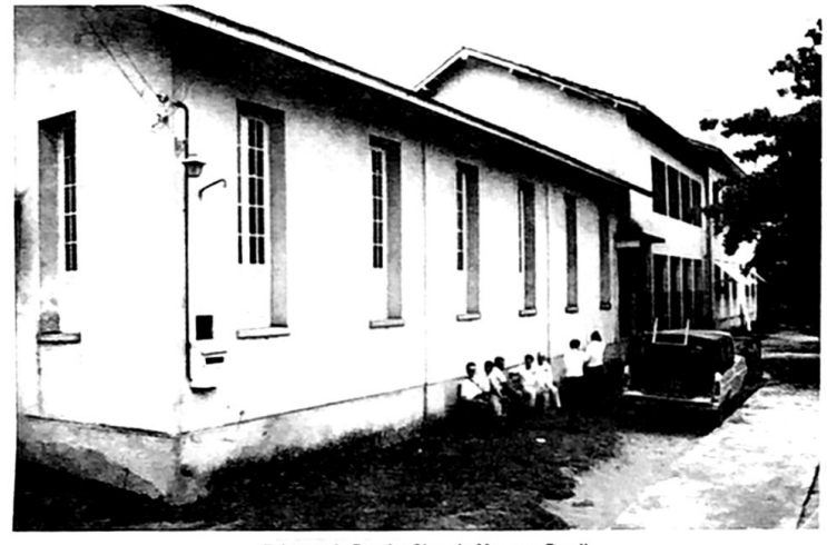
Tabernacle Baptist Church, Manaus, Brazil.