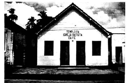
Faith Baptist Church building, Cruzeiro do Sul, Acre, Brazil. This church is across the city from the First Baptist Church in Cruzeiro do Sul. It is a very good building and Sunday School rooms have been added to the rear of it.