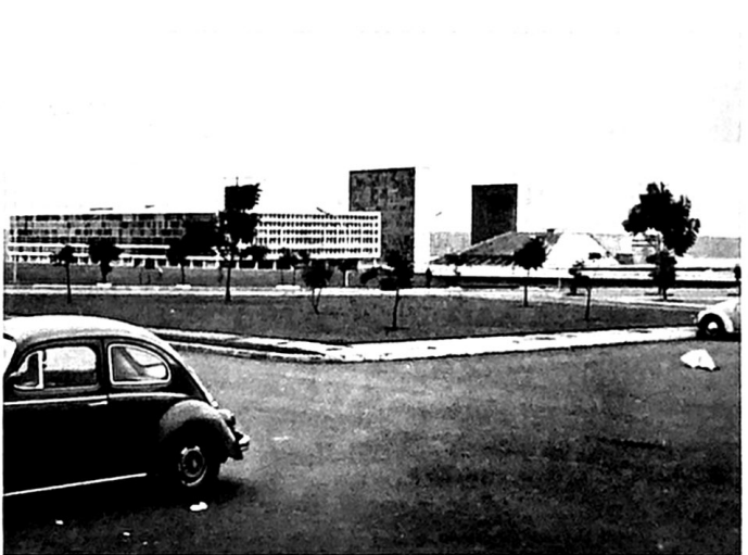
Picture of Government buildings in Brazilia, the new capital of Brazil. A beautiful city built in a clearing in the jungle in central Brazil.