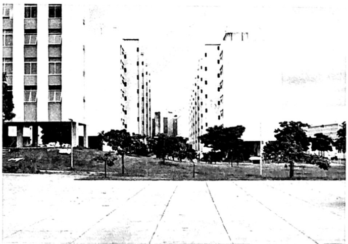
A picture of government buildings in Brazilia, the new capital of Brazil. All buildings are modern and new.