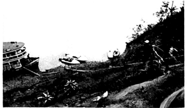
ehind the house where the Mike Creigiow family lives is a good size building is Mike's workshop, then back of this workshop is a steep bank shown in this picture that leads down to the Jurua River, where you see two of Mike's boats, used to make trips to the missions on the rivers.