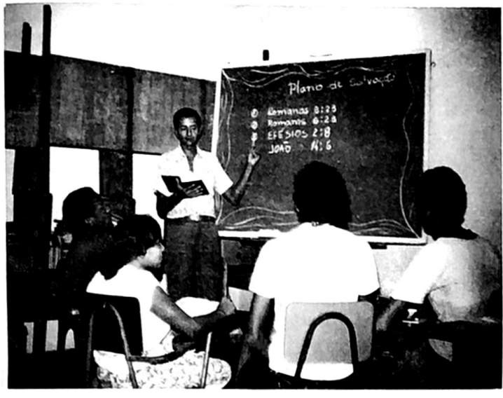
ig the plan of Salvation to a small group in Tabernacle Baptist Church, Manaus