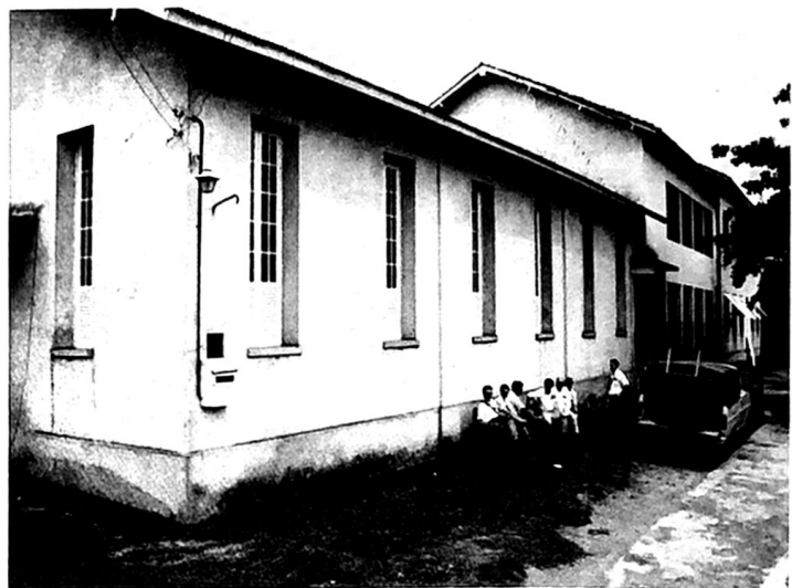
Tabernacle Baptist Church, Manaus, Brazil with two, two story school buildings in the rear of the church. This picture made several years ago. Today building in the rear connecting these, to buildings on the right, with trees now grown up, does not show the two, two story buildings back of the church building. The work continues to go and grow and glow.

Visiting Church Comes For Service And To Baptize Eight . . . Bratcher Baptizes 20 . . . Two By Letter And One Restored . . . Preaches Organization Sermon For New Church Organized . . . Pleads For Increase In Regular Offerings To BFM