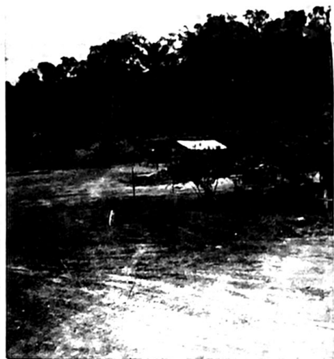
View of the Campground of Tabernacle Baptist Church on the paved road between Manaus, Brazil and Manacapuru, Brazil. Tabernacle Baptist Church owns about 900 acres of this jungle being cleared and buildings being built for the campground. Work of Paul Hatcher.