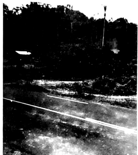
View showing the paved highway along side the Tabernacle Baptist Church, campground where the forest is being cleared and buildings built, several miles out from Manaus, Brazil.

Remember That Special Thanksgiving Offering Especially to the Regular Fund