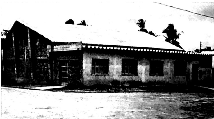
The new First Baptist Church, Cruzeiro do Sul, Acre, Brazil. This picture shows the front and right side with the Sunday School rooms that open into the auditorium. The left side of the auditorium has Sunday School rooms that open into the auditorium like the rooms on the right side. Mike Creiglow built this church with the help of the members of the church without a contractor. It is now the best building and largest church in all the state of Acre, Brazil.