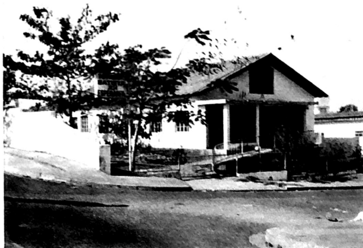
Richard Turner's Good Hope Baptist Church building showing paved street and sidewalk, Cuiaba, Mato Grosso, Brazil as it looks today.