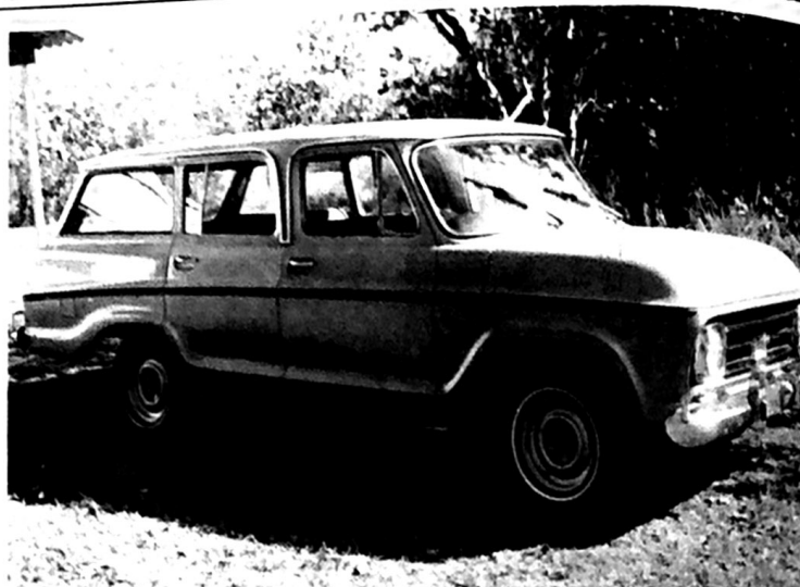
The 1978 Chevrolet station wagon that he bought recently to use in his work in Cuiaba, Brazil.

News From Cruzeiro Do Sul That The Work Is Going Well With Around 200 In Sunday School . . . Visited Churches In Texas, Fla., Tenn., and Miss. . . Missionary Conference Clarksville, Tenn. . . The Lord Is Opening Up Doors . . . Several Commitments Made Towards Work In Cruzeiro Do Sul . . . Teaching Classes In Clarksville Baptist College . . . Ready To Visit Your Church