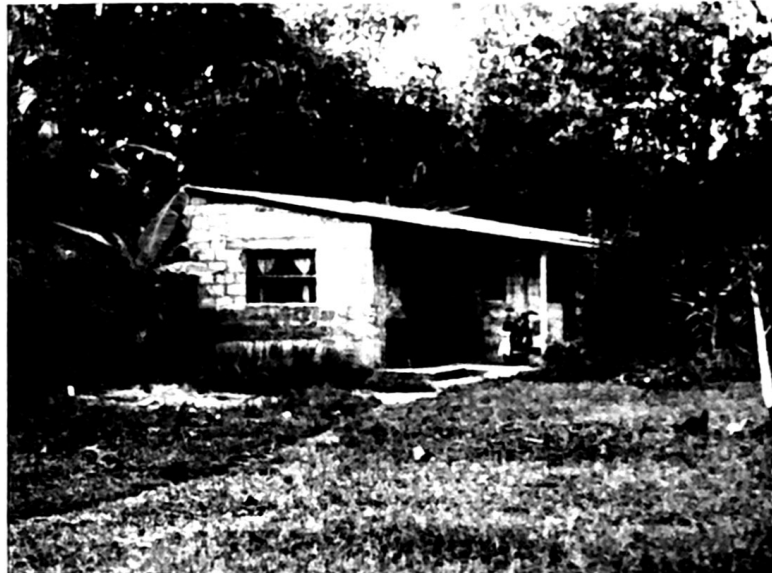
The pastor's home in the rear of Gethsemane Baptist Church, Tingo Maria, Peru. The pastor of the church built this house himself and also has built a baptistry inside the church building. He is a good, hard working native pastor and keeps the church and grounds in good shape.