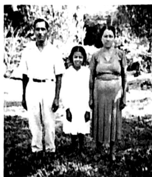
A BIT OF BAPTIST FAITH MISSION HISTORY: July 1951, thirty years ago. Pictures from left to right: They leave Iquitos, Peru and go down the Nanay River and then left up the Momon River, then left up Polis Lucia. This baptizing took place July 19, 1951, thirty years ago. And the work of Baptist Faith Missions continues to GO AND GROW AND GLOW. Aren't you glad you have a part?