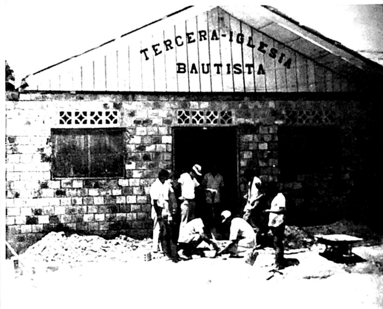
Members of the Third Baptist Church, Iquitos preparing to put a concrete floor in the church building. The words in Spanish say "Third Baptist Church."