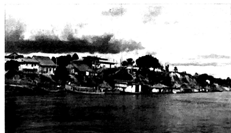
If you were in a boat in the Amazon River about one hour trip up stream from Iquitos, Peru you would come to Tamahyauco. We have a good church here.

Please note the names of all the missionaries at the top of the MISSION SHEETS and pray for them regularly by name, and for their mission work and about their needs. It would be wonderful if each reader, pastor and members would pray for the missionaries by name. This would bring great results in offerings for salaries, expenses and for the needs.