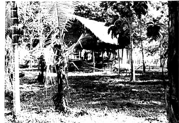
Another jungle home at Atun Canon. On the island in the Amazon River one hour by boat up from Iquitos, Peru.